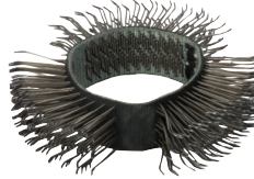
Course Wire Belt 68814