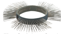
Fine Stainless Steel Wire Belt 68915