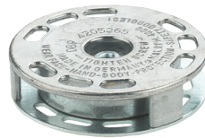
Hub Set SPPT280-300