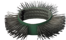
Fine Wire Belt 68813