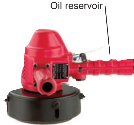
VG30AL-60C6 Cup Wheel Grinder