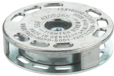
Hub Set 68918