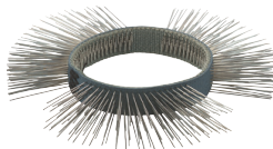
Fine Stainless Steel Wire Belt 68915