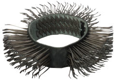
Course Wire Belt 68814