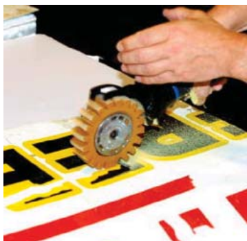
Removes decals, pinstripes moulding tape, adhesives, etc.