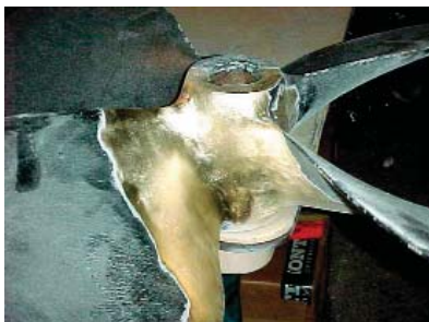
Removes heavy barnacle buildup and 2-part epoxy base coat.