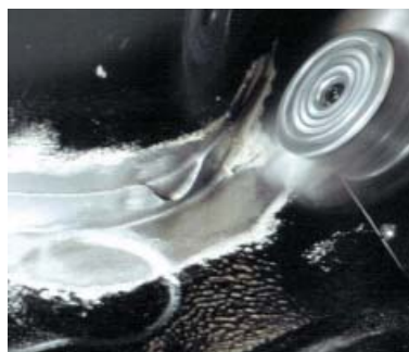
Removes undercoating, slag, and oxidation.