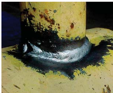
Cleans up welds for painting and knocks off rust without removing viable metals from the seam.