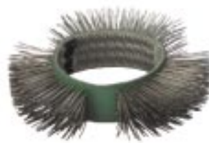
Fine Belt - 68813

The ST2L1410 is the latest design in material removal tools. This product will remove all types of rust, paint or rubberized gaskets without excessive marring of the under surface. There are three types of belts that can be used with this tool depending on the job at hand. The coarse and fine belts are used for