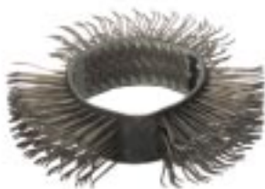
Coarse Belt - 68814