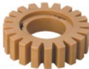
Eraser - 68815