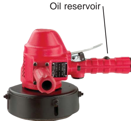
VG30AL-60C6 Cup Wheel Grinder